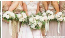
Blooms 'n' Blossoms (859) 421-6910 www.bloomsnblossoms.com