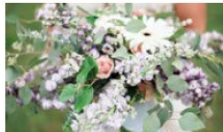
Bel Air Florist and Gifts (877) 473-3000 www.belairflorist.com