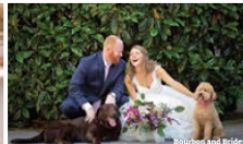
Carol Lynn Originals & Events (859) 203-0545 www.carolynn.com

*This is included complimentary with a traditional advertisement purchase.